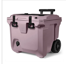
Lilac Dusk (COBK35LLD)