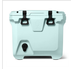
Blue Agave (COBK35BAV)