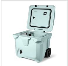
Blue Agave (COBK35BAV)