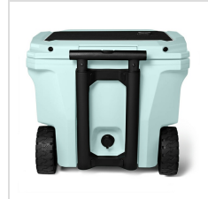
Blue Agave (COBK35BAV)