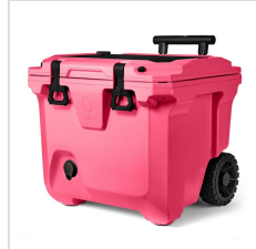
Neon Pink (COBK35NPK)