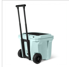
Blue Agave (COBK35BAV)