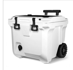
Ice White (COBK35WHT)