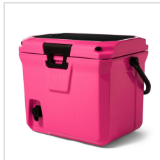
Neon Pink (COBK20NPK)