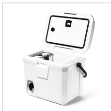
Ice White (COBK20WHT)