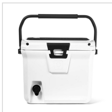
Ice White (COBK20WHT)