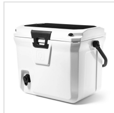
Ice White (COBK20WHT)