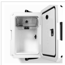
Ice White (COBK20WHT)