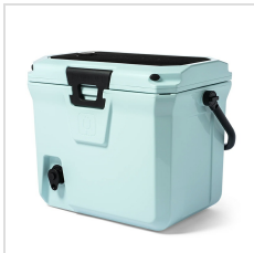
Blue Agave (COBK20BAV)