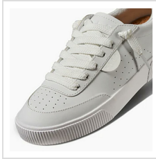
White Leather (CJ5179)