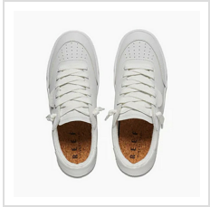
White Leather (CJ5179)