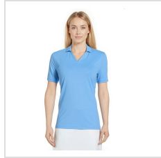
Vista Blue (CGW809-431)