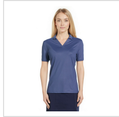
Peacoat Navy (CGW809-410)