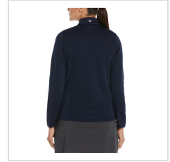
Peacoat Navy (CGW793-410)