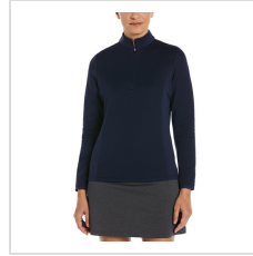
Peacoat Navy (CGW793-410)