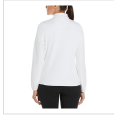
Bright White (CGW793-100)