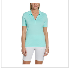
Aruba Blue (CGW751-468)