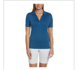
Blueberry Pancake (CGW751-461)