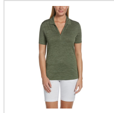
Hedge Green (CGW751-325)