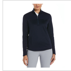
Peacoat Navy (CGW704-410)