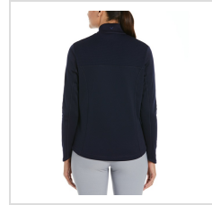
Peacoat Navy (CGW704-410)