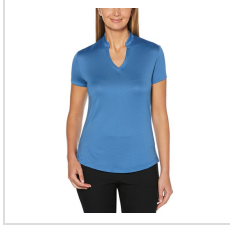
Surf The Web / Silver Lake Blue (CGW703-498)