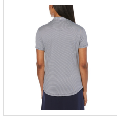
Peacoat Navy/White (CGW703-963)