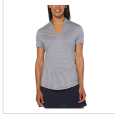
Peacoat Navy/White (CGW703-963)