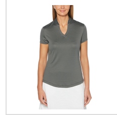
Black/Quite Shade (CGW703-001)