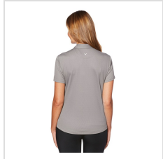
Quite Shade (CGW693-039)