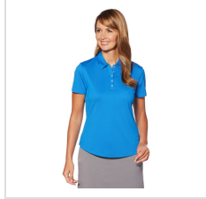
Magnetic Blue (CGW693-492)