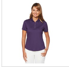
Parachute Purple (CGW693-501)