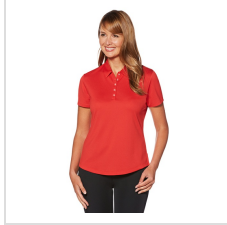
Salsa Red (CGW693-625)