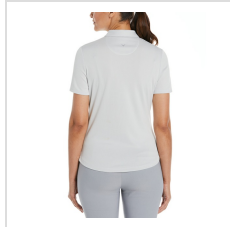
Bright White Silver (CGW693-100)