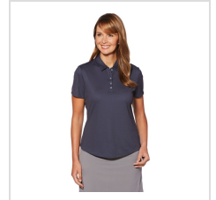
Peacoat Navy (CGW693-410)