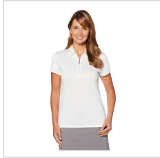
Bright White (CGW625-100)