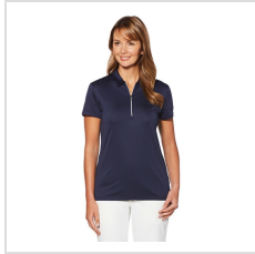
Peacoat Navy (CGW625-410)