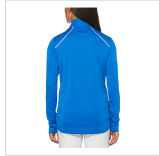
Magnetic Blue (CGW545-492)