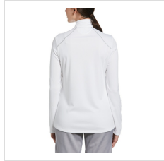
Bright White (CGW545-100)