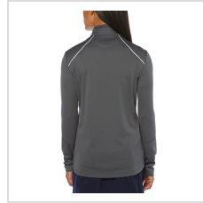
Iron Gate (CGW545-029)