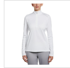
Bright White (CGW545-100)