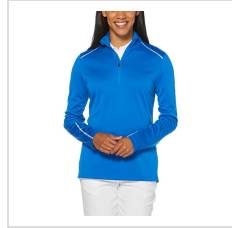
Magnetic Blue (CGW545-492)