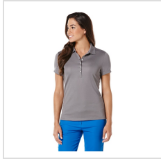
Quite Shade (CGW435-027)