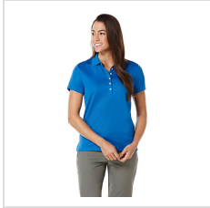
Magnetic Blue (CGW435-492)