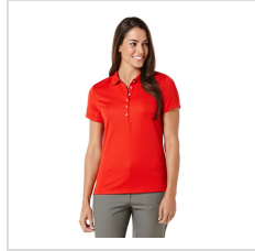
Salsa Red (CGW435-625)