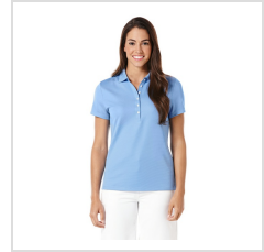
Provence Blue (CGW435-489)