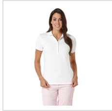
Bright White (CGW435-100)