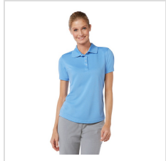
Provence Blue (CGW212-489)