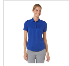
Surf The Web (CGW212-433)