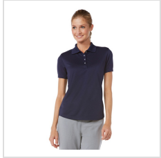
Peacoat Navy (CGW212-410)