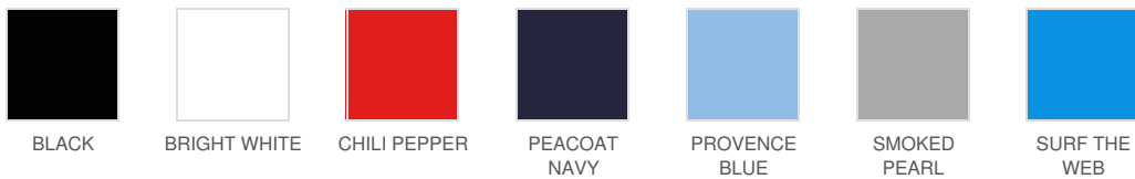
BLACK BRIGHT WHITE CHILI PEPPER PEACOCK NAVY PROVENCE BLUE SMOKED PEARL SURF THE WEB