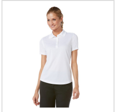
Bright White (CGW212-100)