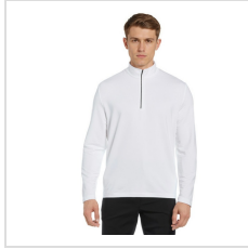
Bright White (CGM803-100)