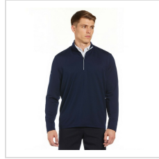
Peacoat Navy (CGM803-410)