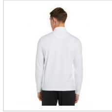
Bright White (CGM803-100)