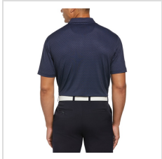
Peacoat Navy (CGM794-410)