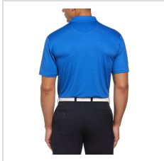
Lapis Blue (CGM794-429)