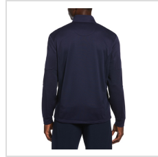
Peacoat Navy (CGM771-410)