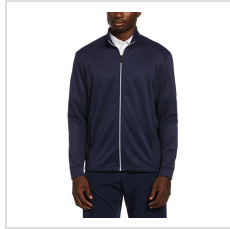
Peacoat Navy (CGM771-410)