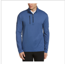
Coastal Fjord (CGM742-426)