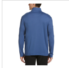
Coastal Fjord (CGM742-426)