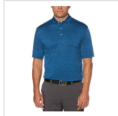
Blueberry Pancake (CGM737-461)