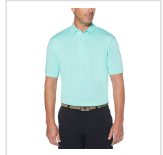
Aruba Blue (CGM737-468)