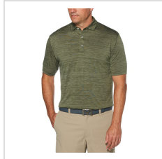
Hedge Green (CGM737-325)