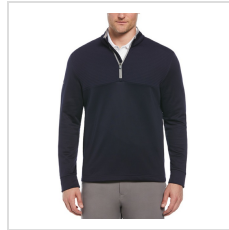
Peacoat Navy (CGM715-410)