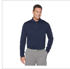
Peacoat Navy (CGM670-410)