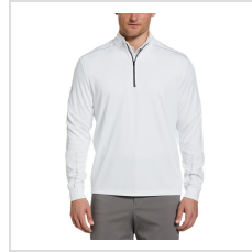
Bright White (CGM540-100)