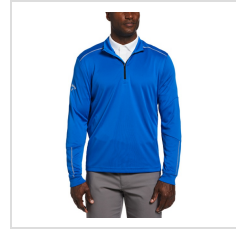
Magnetic Blue (CGM540-492)