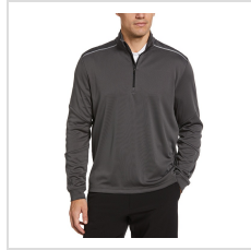
Iron Gate (CGM540-029)