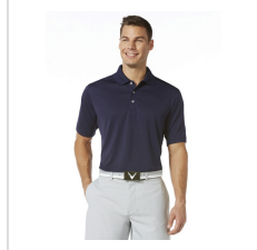
Peacoat Navy (CGM211X-410)