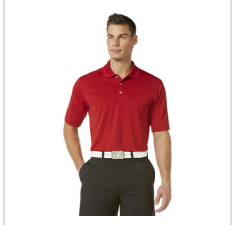
Chili Pepper (CGM211X-600)