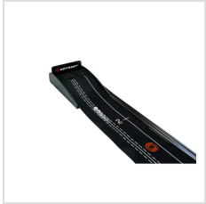
Top View (C30501)