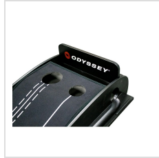
Odyssey Logo View (C30501)