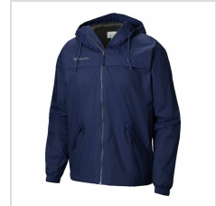
Collegiate Navy (C2524MO_464)