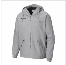
Cool Grey (C2524MO_019)