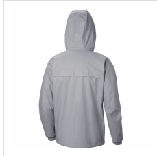
Cool Grey (C2524MO_019)