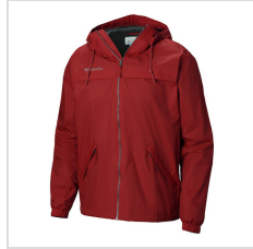
Intense Red (C2524MO_610)