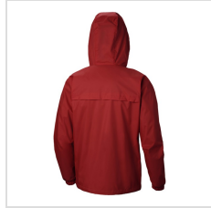
Intense Red (C2524MO_610)