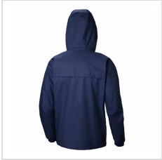
Collegiate Navy (C2524MO_464)