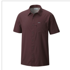
Deep Maroon (C2001MP-699)