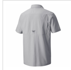
Cool Grey (C2001MP-019)