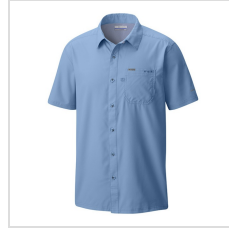
White Cap (C2001MP-450)