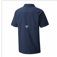
Collegiate Navy (C2001MP-464)