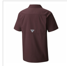
Deep Maroon (C2001MP-699)