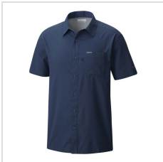
Collegiate Navy (C2001MP-464)