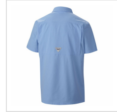
White Cap (C2001MP-450)