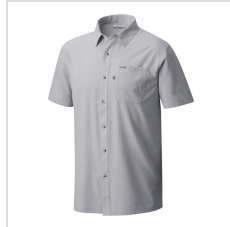
Cool Grey (C2001MP-019)