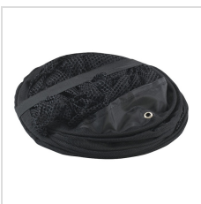
Callaway Chip Shot Chipping Net*