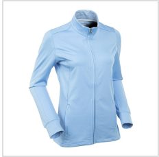
Sky Blue (BW482300-459)