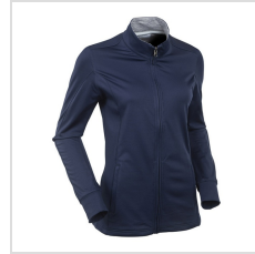
Summer Navy (BW482300-993)