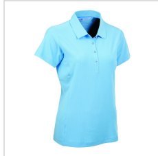
Sky Blue (BW232301-459CE)