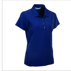
Summer Navy (BW232301-993CE)