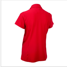
Cambridge Red (BW232301-582CE)