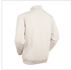
Oatmeal Heather (BJL472308-127)