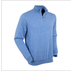
Azure Heather (BJL472308-4333)