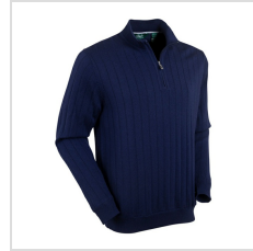
Summer Navy (BJL472308-993)