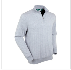
Heather Grey (BJL472308-078)