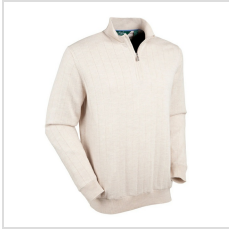
Oatmeal Heather (BJL472308-127)