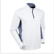
White/Summer Navy (BJ482635-100N)