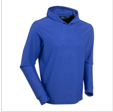
Marina Blue (BJ482502-401)