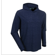
Summer Navy (BJ482502-993)