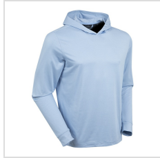
Sky Blue (BJ482501-459)