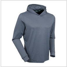
Summer Navy (BJ482501-993)