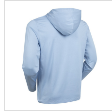
Sky Blue (BJ482501-459)