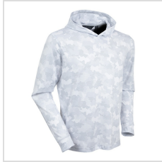
Grey Mist (BJ482500-061)