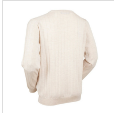
Oatmeal Heather (BJ472306-127-1)