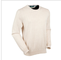
Oatmeal Heather (BJ472306-127)