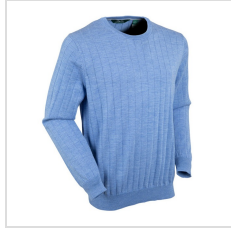
Azure Heather (BJ472306-4333)