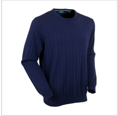
Summer Navy (BJ472306-993)