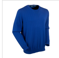
Marina Blue (BJ472306-401)