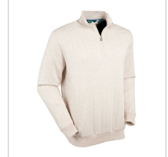
Oatmeal Heather (BJ472304-127)