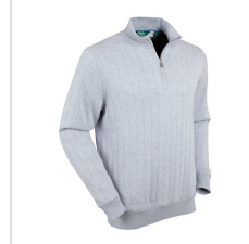
Heather Grey (BJ472304-078)