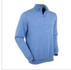
Azure Heather (BJ472304-4333)