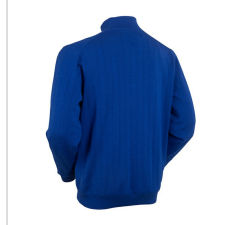
Marina Blue (BJ472304-401)