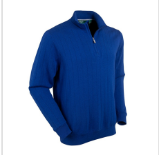
Marina Blue (BJ472304-401)