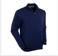
Summer Navy (BJ472304-993)