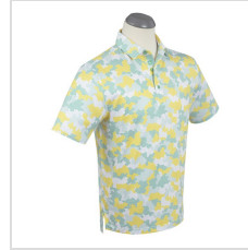
Master's Green (BJ232315-325CE)