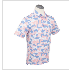
Mineral Red (BJ232315-645CE)