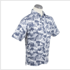
Summer Navy/White (BJ232315-993WCE)