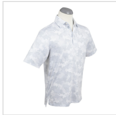
Grey Mist (BJ232315-061CE)