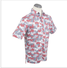
Cambridge Red (BJ232315-582CE)