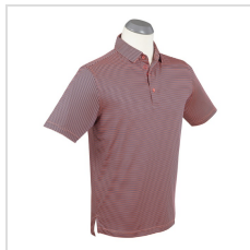
Mineral Red/Summer Navy (BJ232312-645N)