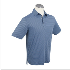
Sky Blue/Summer Navy (BJ232312-459N)