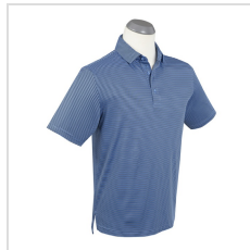
Classic Blue/Summer Navy (BJ232312-435N)