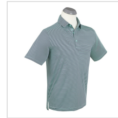
Mint/Summer Navy (BJ232312-336N)