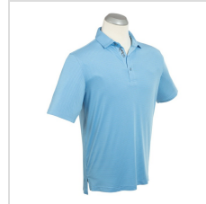
Sky Blue (BJ232312-459)