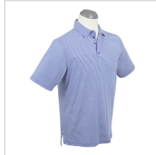
Marina Blue/White (BJ232312-401W)