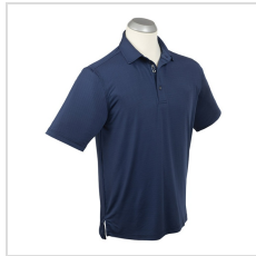
Summer Navy (BJ232312-993)