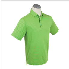
Master's Green (BJ232312-325CE)