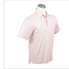
Almond Blossom (BJ232312-655)