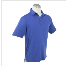
Marina Blue (BJ232312-401)