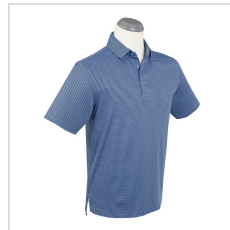
Marina Blue/Lavender (BJ232312-401L)