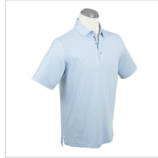
Sky Blue/White (BJ232312-459W)