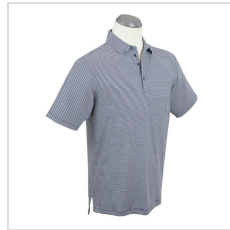
Summer Navy/White (BJ232312-993W)