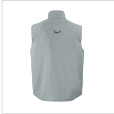
Cutter and Buck Charter Eco Recycled Full-Zip Vest- Men's Big and Tall-