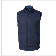
Liberty Navy (BCC00008-LYN)