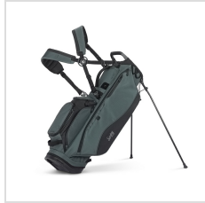
BAG405-14W-MG (midnight green)