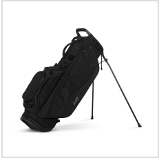
BAG401-14W-MB (matte black)