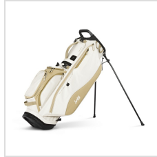
BAG405-14W-TA (toasted almond)