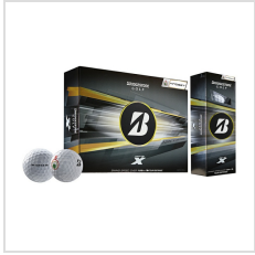
Dozen Box, Sleeve, and Balls