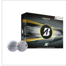
Dozen Box and Balls