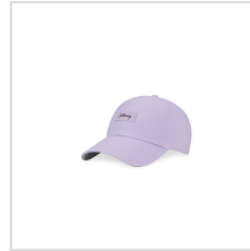
Orchid Petal (A00066_I0028)