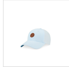
Ice Blue (A00061_C0576)