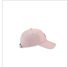
Ice Pink (A00061_H0094)