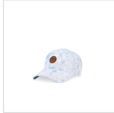
Blue Watercolor (A00061_Q0603)