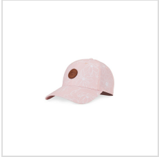
Pink Blossom (A00061_Q0516)