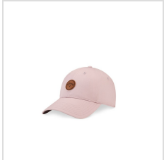
Ice Pink (A00061_H0094)