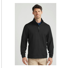
Black Granite (9991-BG)