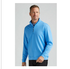
marine blue (9991-MB)