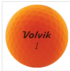
Matte Orange (9902)