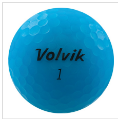
Matte Blue (9906)