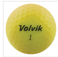
Matte Yellow (9904)