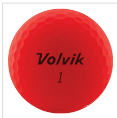
Matte Red (9903)