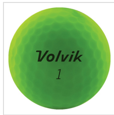
Matte Green (9901)