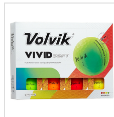
Matte Assorted (9900)