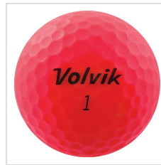
Matte Pink (9905)