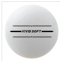
Matte White (9907)