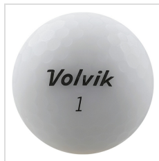
Matte White (9907)