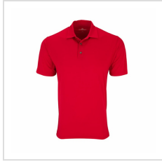
Red Sky (8060-RES)