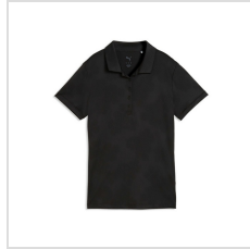
Puma Black (635432-02)