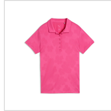
Pink Opal (635432-03)