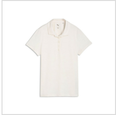
Warm White (635432-01)