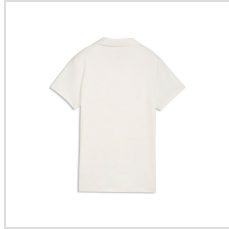
Warm White (635432-01)