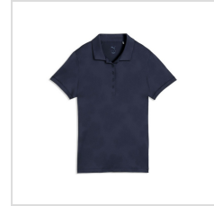
Deep Navy (635432-04)