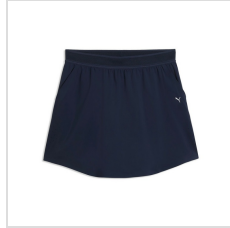
Deep Navy (635034-10)