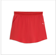
Candy Apple (635034-05)