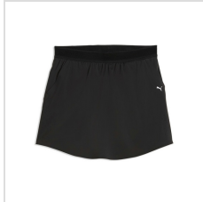
Puma Black (635034-02)