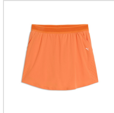
Melon Glow (635034-03)