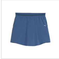
Dark Indigo (635034-06)