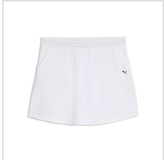
White Glow (635034-01)