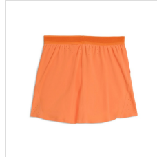
Melon Glow (635034-03)