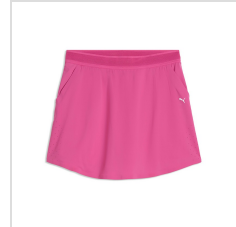
Pink Opal (635034-04)