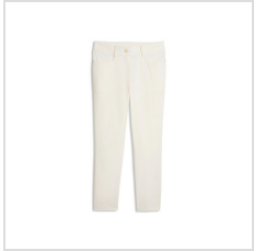
Warm White (634948-01)