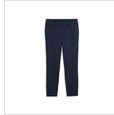
Deep Navy (634948-03)