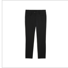
Puma Black (634948-02)