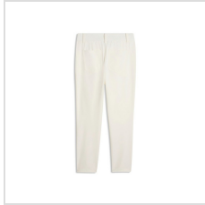
Warm White (634948-01)