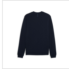
Deep Navy (633737-07)