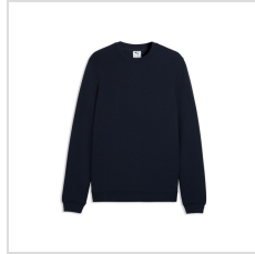
Deep Navy (633737-07)