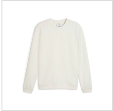
Warm White (633737-01)