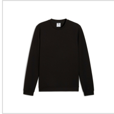
Puma Black (633737-02)